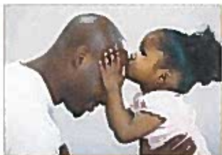
Father/Daughter - February 13, 2019