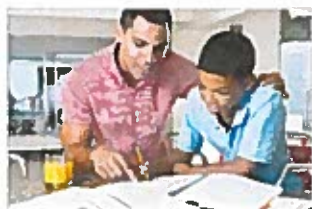
Father/Son - March 6, 2019

The DOHS Peer Educators strategically plan the events from the décor to the activity and theme. It is astonishing how creative they are and the ideas get better and better. The Peer Educators have been hosting community